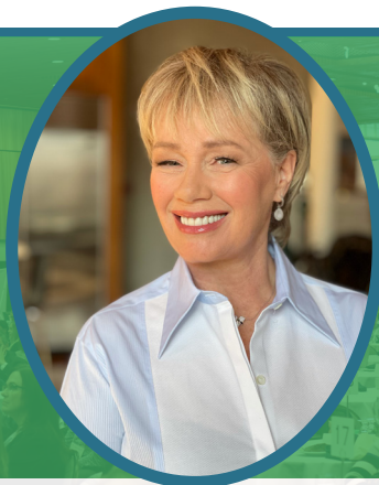
Arlene Dickinson KEYNOTE SPEAKER

General Partner, District Ventures Capitol, Dragon on CBC's Dragons Den, and Author.